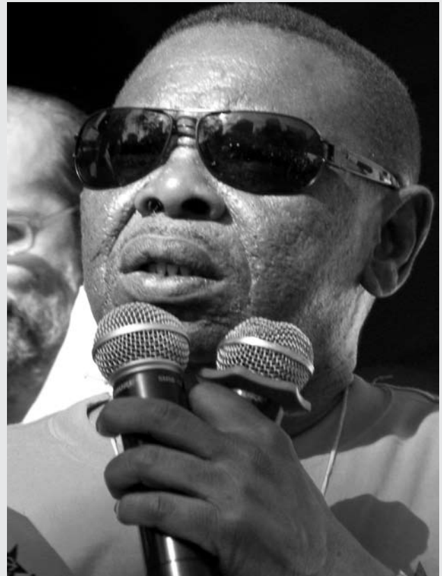
Blade Nzimande: The revolution is on trial – we must defend our unity at all costs