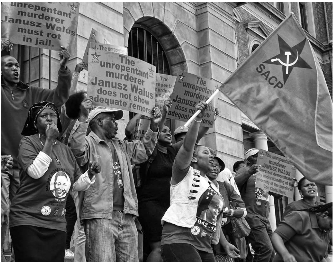
Outside court: SACP members and supporters demand that killer Janusz Walus be denied parole. Cde Hani's assassin will remain in prison until a petition to the Supreme Court of Appeal is heard

distance from the people insider the country.”