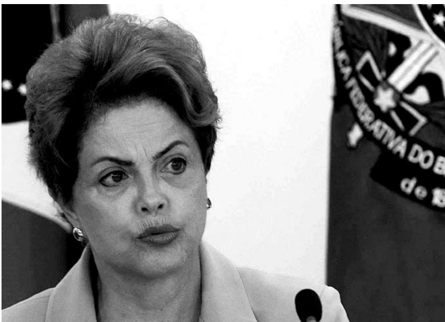
President Dilma Rousseff: primary target of the creeping coup

ravaged the public accounts. Their frantic and seemingly random interventionism scared away the internal bourgeoisie: local magnates were content to run government through the Workers' Party, but would not be managed by a former political prisoner who overtly despised them.