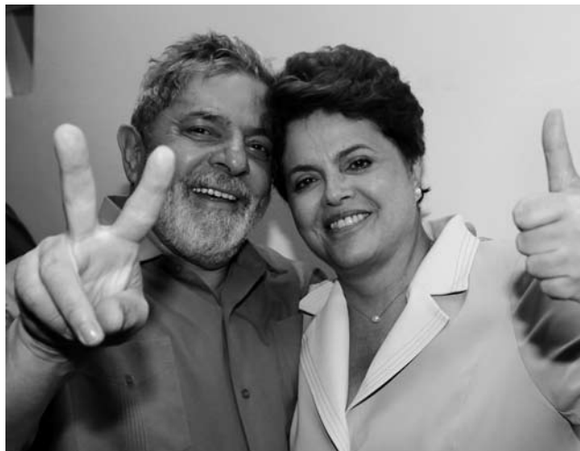
Ex-President Lula da Silva and his successor, incumbent President Dilma Rousseff

aggressive scrutiny, no presidential crime warranting impeachment proceedings has emerged. Nevertheless, the political Right has thrown the kitchen sink at Dilma Rousseff. They rejected the outcome of the 2014 elections and appealed against her alleged campaign finance violations, which would remove from power both Dilma and vice president Michel Temer, now the effective leader of the impeachment.