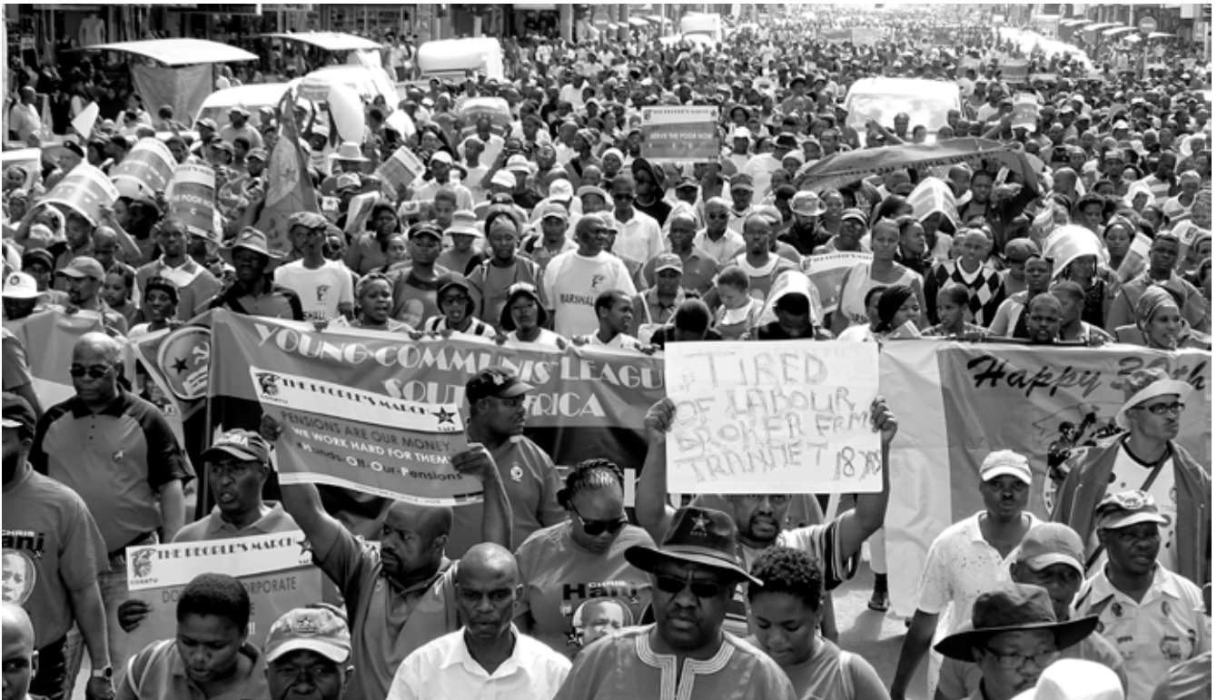
SACP and Cosatu members march through eThekweni on the Red Weekend to support worker demands

The first step in a campaign of rolling mass action by the two Alliance partners