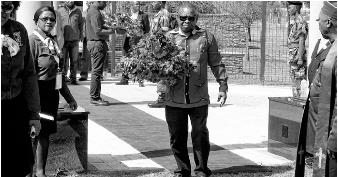
General Secretary Blade Nzimande lays a wreath on behalf of the SACP during the 25th anniversary commemoration of Cde Chris Hani's assassination

Throughout the country, Party activists at national, provincial, district and branch levels, mobilised to build on the legacy of the slain SACP general secretary